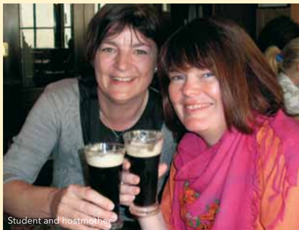
Student and hostmother

Age is not important in Ireland as young and old socialise together. Traditional pubs are a meeting place for Irish people of all ages. They are places to catch up with friends, relax, unwind and enjoy a Guinness, Powers or Jameson whiskey and listen to a traditional music session.