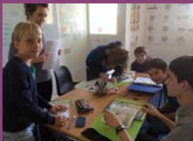
Keen Teens Course