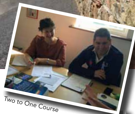
Two to One Course