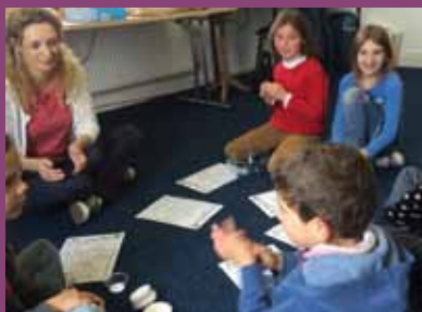
Cool Kids Course