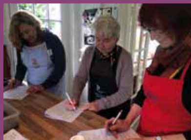
Irish Culture Course