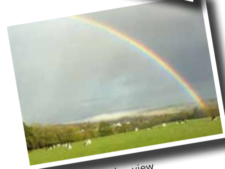
A classroom with a view

The Slaney Language Centre is recognised by the Department of Education & Science for the Teaching of English as a Foreign Language. Member of MEI.