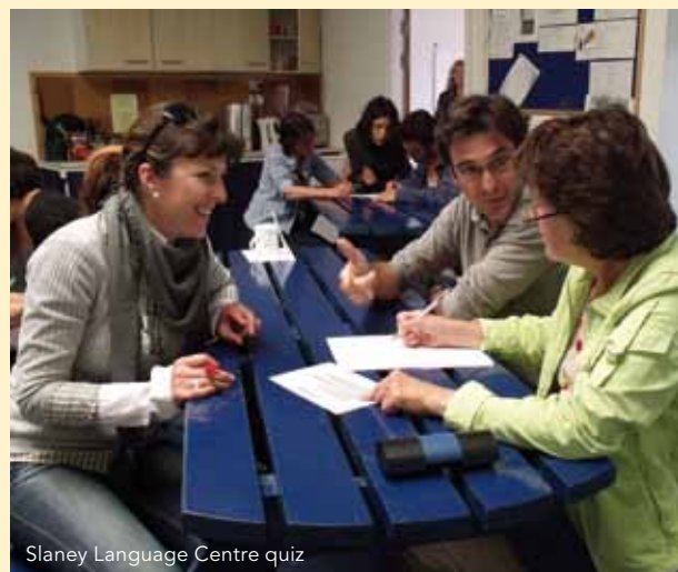
Slaney Language Centre quiz

There is always time to have a chat or ask for help and information, so please feel free to ask us any questions that you may have.