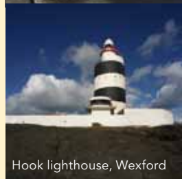
Hook lighthouse, Wexford