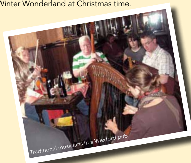
Traditional musicians in a Wexford pub

Watch the St Patrick's Day parade in March . Visit our beautiful never-ending sandy beaches. Go in for a swim in Summer . Enjoy our Slaney Language School barbeque in June (in June 2016 The Slaney Language Centre will be 17 years old) . Be here during the internationally renowned Wexford Festival Opera in October or come in November/December/February to avail of free weekly conversation classes and to enjoy the Winter Wonderland at Christmas time.