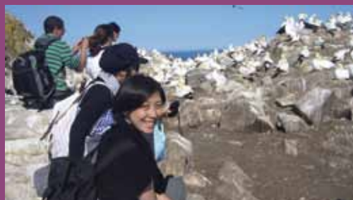
Birdwatching on the Saltee Islands

Please note: A minimum of 5 students is required for an afternoon activity. A minimum of 10 students is required for a weekend daytrip.