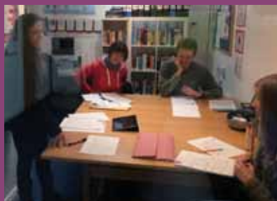
General English Course